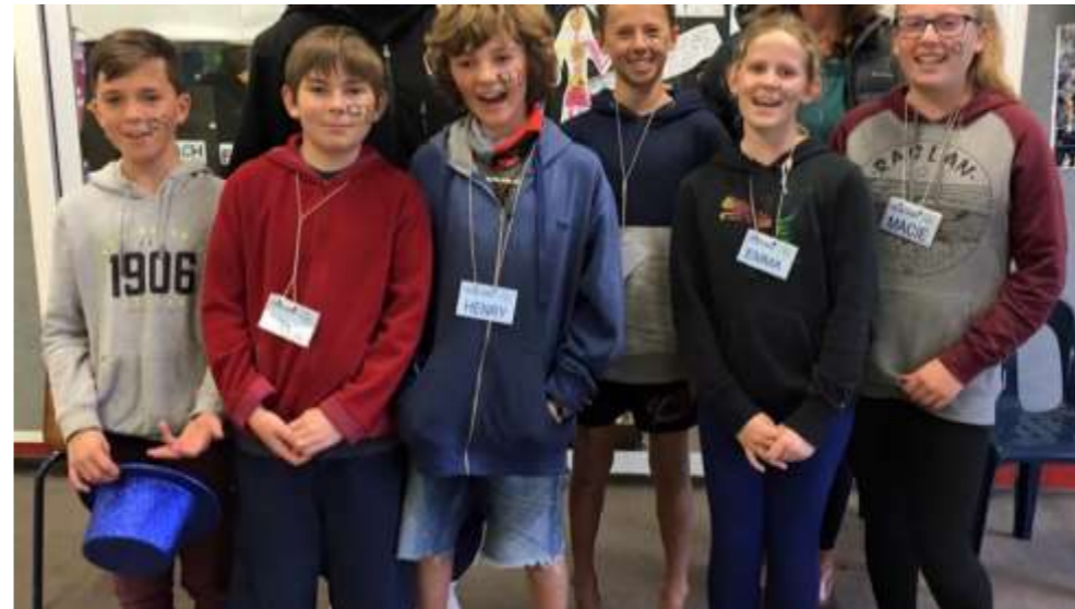
USA, New Zealand, Australia, Germany, Britain and Jamaica