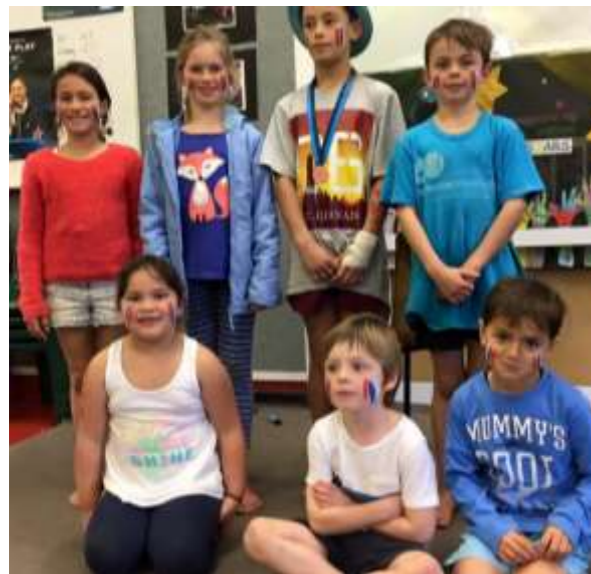
Silver Medal: NZ

Kia Ora parents, whanau and care-givers, Walking through the classrooms this week (and teaching the students) I have noticed a wonderful settled but enthusiastic learning vibe from the students. Our Believe I Can focus has students and teachers humming. Our students have been tracking the medal count as inspiring New Zealanders to 'put everything into it' at both the Olympics and the Paralympics, 2016. Our Mini-Olympics was fantastic! Students chose their own Olympic Countries and dressed up in the appropriate colours for the occasion. Senior leaders organised and judged their selected event with the support of Richard Battersby from Energise. ANZ Bank donated medals for the winners. Winners were based on the Olympic Values: Respect, Friendship and Excellence. The winning teams were: Gold Medal: Australia (front cover) . Bronze Medal: USA